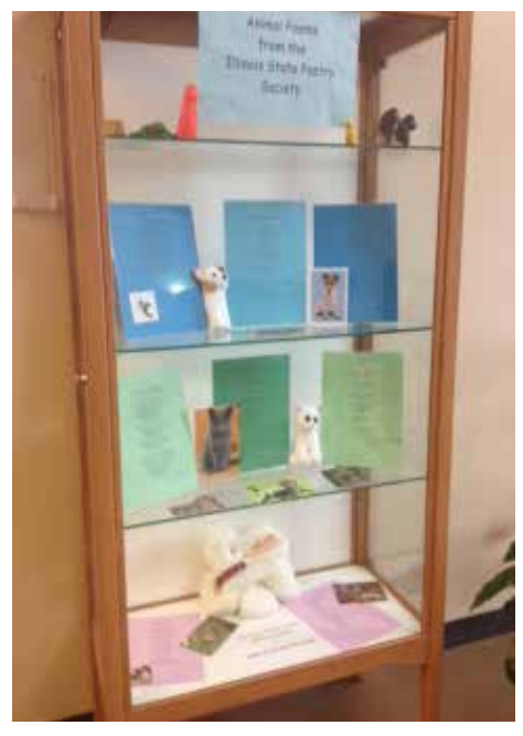
Indian Prairie Library in Darien featured animal-themed poems by eighteen ISPS members during the month of August.

teenth book, contains new poems that illustrate significant moments in her life as well as the inexorable progression of her poetry. The subjects range from the personal elements of the title poem to historical, social, and cultural interweavings of the textile poems.